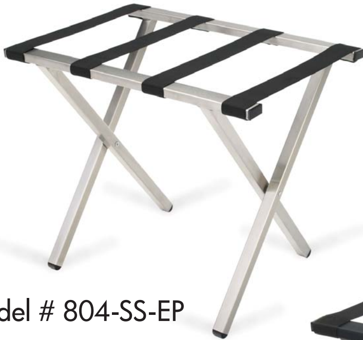
Model # 804-SS-EP

Available in Brushed Stainless Steel or Powder-epoxy painted steel