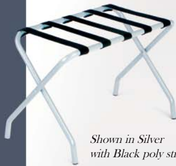
#803 Overall Dimensions: 30"W (76 cm) 18"D (46 cm) 20.5"H (52 cm)