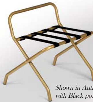
#800 Overall Dimensions: 24"W (61 cm) 21"D (53 cm) 24.5"H (62 cm)

Constructed out of durable 1" diameter steel tube. These racks are offered in several sizes, with or without bumpered back bar and are available in 12 standard finishes.