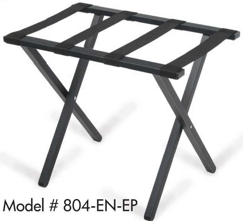
Model # 804-EN-EP

Available in Brushed Stainless Steel or Powder-epoxy painted steel