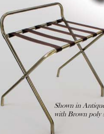
#807 Overall Dimensions: 30"W (76 cm) 23"D (58 cm) 31.5"H (80 cm)